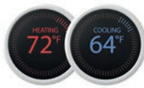
Smart Wi-Fi Thermostat

Sample Thermostats are for illustration purposes only