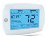
Touch Screen Thermostat