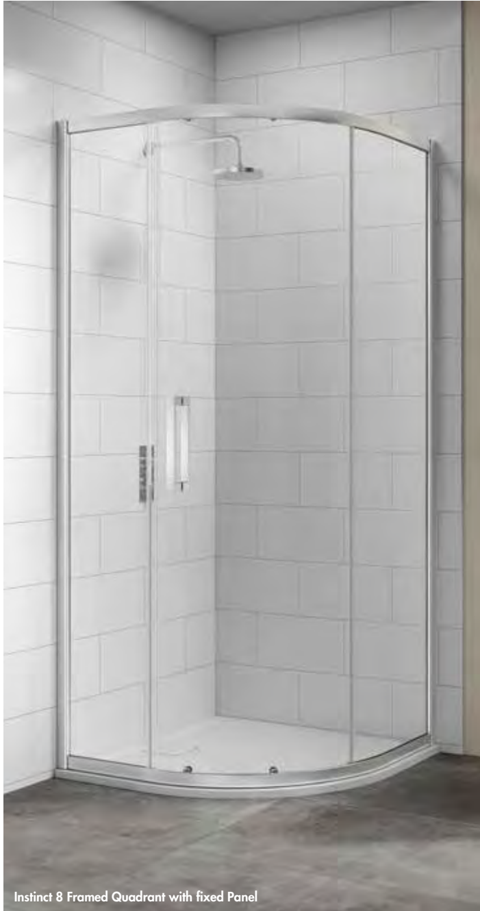
Instinct 8 Framed Quadrant with fixed Panel