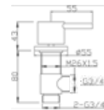
Side Valve Pair